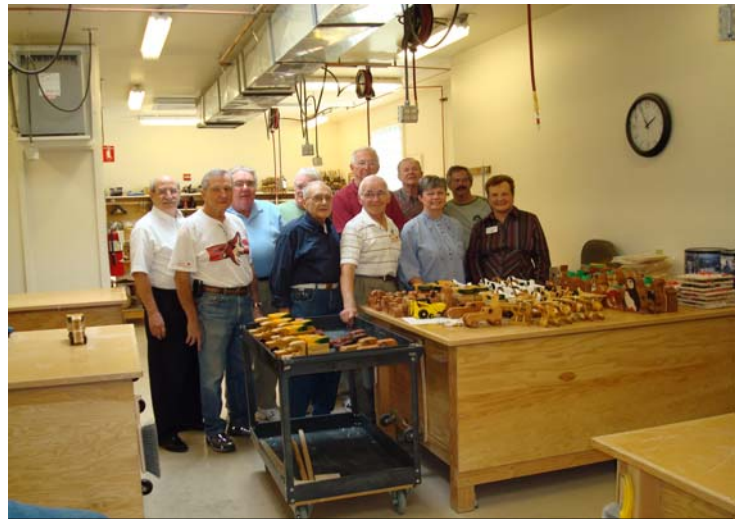
Sun City Grand Woodworkers

They have over 40 members who spent time this year turning wood into puzzles, crayon toys,